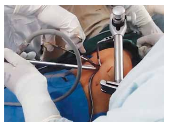
Fig. 6: Lift laparoscopic suturing outside view. The left hand holds the uterine manipulator