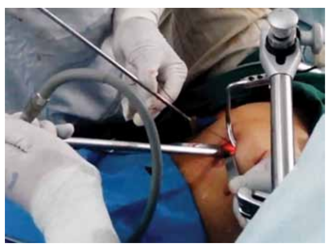
Fig. 7: Extracorporeal tying and pushing with pusher

pneumoperitoneum in addition to causing physiological changes has small but definite complications. <sup>10</sup> Several animal studies have documented problems that are associated with use of carbon dioxide for insufflation. <sup>11-15</sup> Despite the advantages gasless laparoscopic surgery did not become very popular because of the technical difficulty especially due to tenting of the abdominal wall with the available equipment. <sup>4</sup> The equipment designed by Dr Daniel Kruschinski had the best exposure or vision. <sup>16</sup> This coupled with steep Trendelenburg position made single incision surgeries possible.