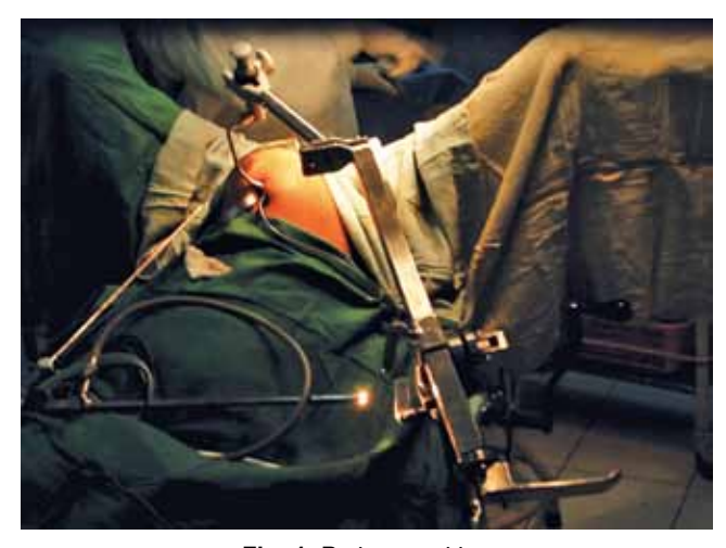
Fig. 1: Patient position

The patient is placed in head down position to have the intestines move away from the field of vision. An atraumatic forceps could be used for this. The uterine manipulator is used to hold the uterus in a most convenient way to remove the myoma. A monopolar hook is used to make an incision over the uterus to reach the fibroid. Combination of blunt and sharp dissection is used for removing the fibroid (Figs 2 and 3). Sutures are placed to close the incision in the uterus using the regular long needle holder and number 1 Vicryl suture (Figs 4A and B).