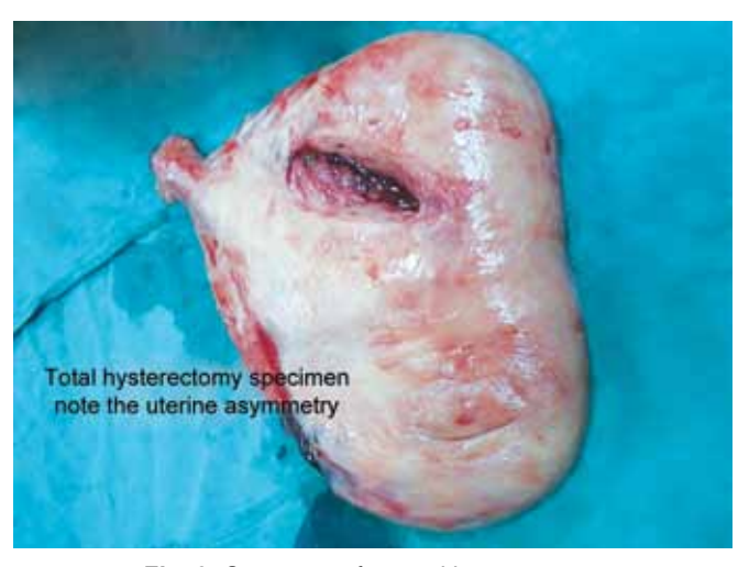
Fig. 3: Specimen after total hysterectomy

Torsion of gravid uterus is very rare. In this case, correct diagnosis was not made before laparotomy. The reports of all cases published so far show that torsion was recognized only at laparotomy. In this case, the torsion can be explained because of asymmetrical enlargement of the uterus. Excess liquor may be an additional factor. The enlarged part of the uterus was very tense and thin walled because of excess liquor. There was also placental abruption in this case. Torsion likely caused placental abruption by causing engorgement and high pressure within the uterine wall. Because of torsion, the hemorrhage from abruption was concealed and not allowed to escape. Alternatively, abruption could have