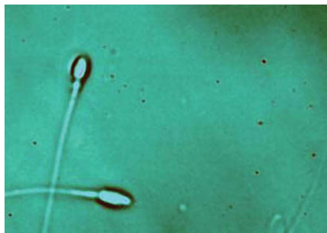
Fig. 2: Sperms magnified 7200 times to identify vacuoles