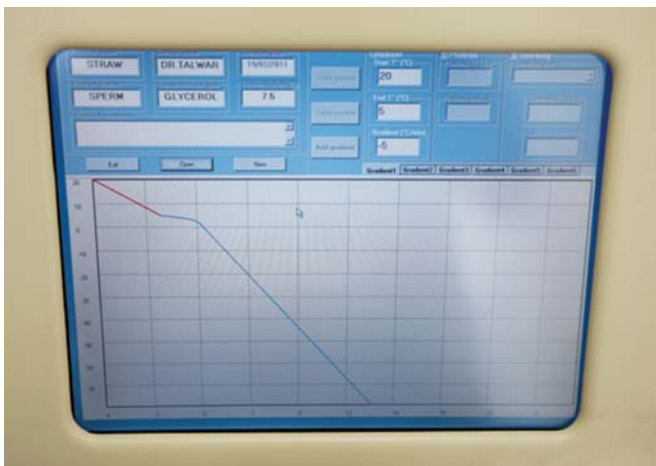
Fig. 2: Typical freezing curve for semen freezing as seen on the freezal