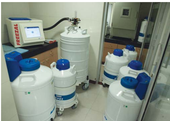
Fig. 1: Cryobiology laboratory freezal cryofreezer and cryocans of various sizes

Indian Council of Medical Research has issued comprehensive guidelines for assisted reproductive technology centers. These are guidelines which may be applied to any functioning semen bank. An ART clinic or a law firm or any other suitable independent organization may set up a semen bank. All donors should produce their semen samples within the collection area of the center so, that the sample cannot be substituted by others semen sample. It is essential that there is suitable privacy, time and environment for patients to do this. Donor records and coding of the specimens stored must be kept securely. The centers should audit their cryobanks annually. As per the ICMR guidelines, the semen bank shall not supply semen of one donor for more than 10 successful pregnancies. It will be the responsibility of the ART clinic or the patient, to inform the bank about a successful pregnancy. The bank shall keep a record