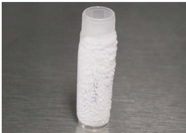
Fig. 4: Cryovial being thawed at the room temperature. Sweating on the vial can be appreciated