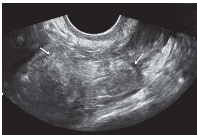
Fig. 1: Transvaginal ultrasonography showing inhomogeneous hyperechoic mass (white arrows) in the right adnexa

Heterotopic pregnancy should be kept in mind even if an intrauterine pregnancy is diagnosed and one should take extra