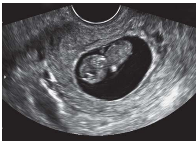
Fig. 3: Transvaginal ultrasonography showing ongoing viable intrauterine pregnancy

Transvaginal ultrasonography is an important aid in the diagnosis of heterotopic pregnancy, but ultrasonographic identification of ectopic pregnancy is low in its sensitivity. 8 Some findings, such as extrauterine gestational sac with fetal cardiac activity, fetal node, and hyperechogenic ring surrounding the gestational sac and adnexal mass, point to tubal heterotopic pregnancy. Suspicious adnexal masses can be investigated with Doppler ultrasound in an attempt to improve sensitivity and specificity. Taylor and coworkers have described